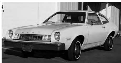
1977 Ford Pinto, only 16K miles and it looks brand new!