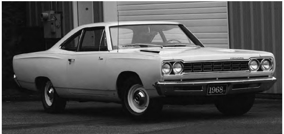
The yellow 1968 Roadrunner is a 62,000-mile original. It doesn't have power anything -- the original owner apparently wanted all of the power delivered to those (optional) Torq Thrust wheels.