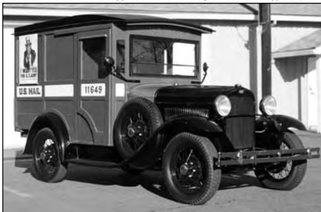
The 1931 Ford Post Office Truck will become part of Bill's permanent collection.